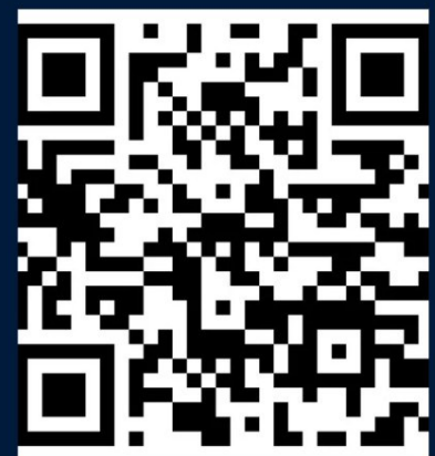
SOFTBALL QR CODE